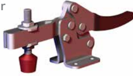
245-U Flanged Base U-Bar